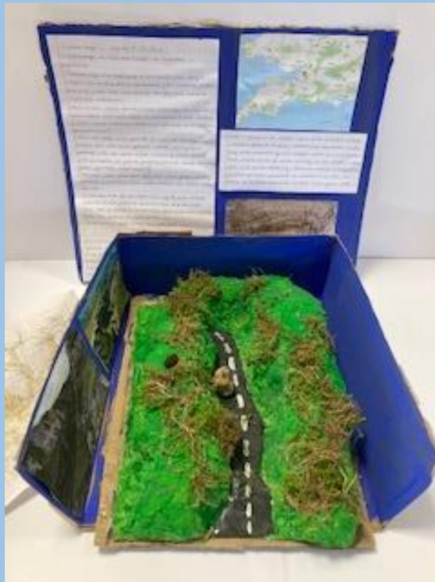
Georgina I - Peppard