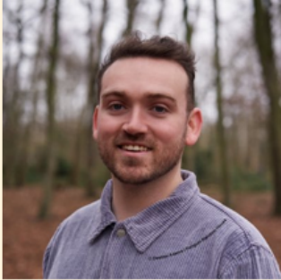
Waterstones Book of the Month March 2022.