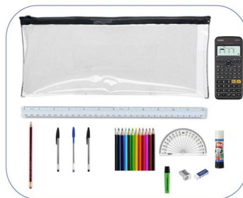
The MECE Tools for Learning

These items are checked twice weekly by tutors to ensure students have the full range of equipment. We sell the items listed at cost price in our school shop.