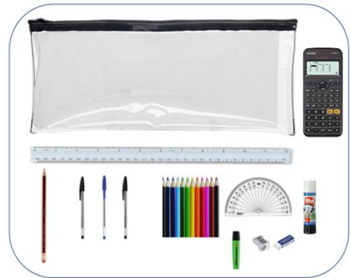
The MECE Tools for Learning

These items are checked regularly by tutors to ensure students have the full range of equipment. We sell the items listed at cost price in our school shop.