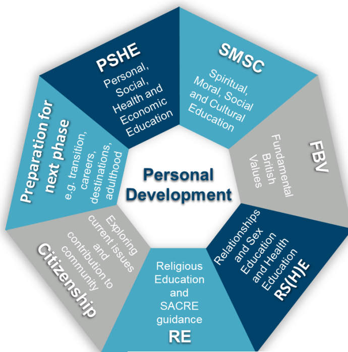
Figure 2: Personal Development Provision

It also provides for coverage of local and contextual themes, as well as any current issues (e.g. elections).