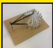
Mini Architecture, Year 9