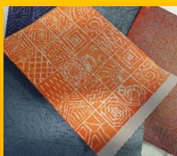
African Prints, Year 10