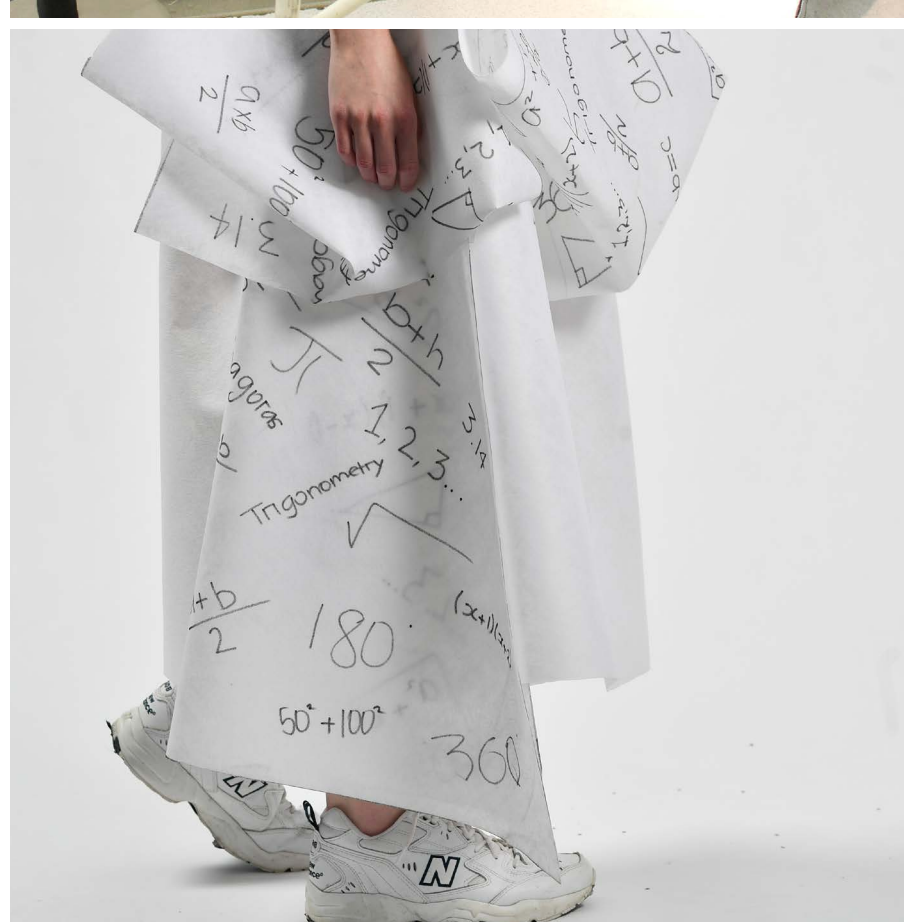
Image credit: London College of Fashion; English National Opera costume Masterclass, Magnus Andersson; Kingston University London